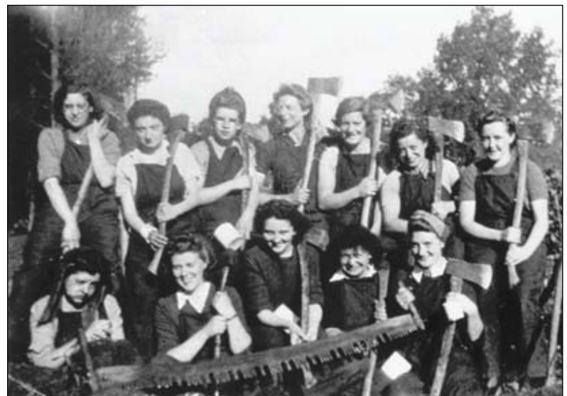
The women who served in the Corps had to learn how to use both the axe and the cross-cut saw.